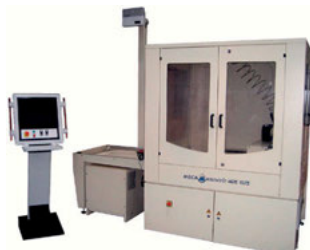
MDE Pure water jet cutting equipment