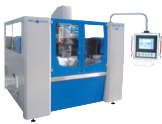
Quickjet II Closed water jet cutting equipment dimension 1000x1200 mm