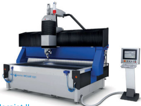
Mecajet II Equipment for the very high-pressure water jet cutting

Other products of the WATER JET PRODUCT RANGE